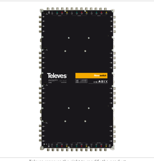
Televes reserves the right to modify the product