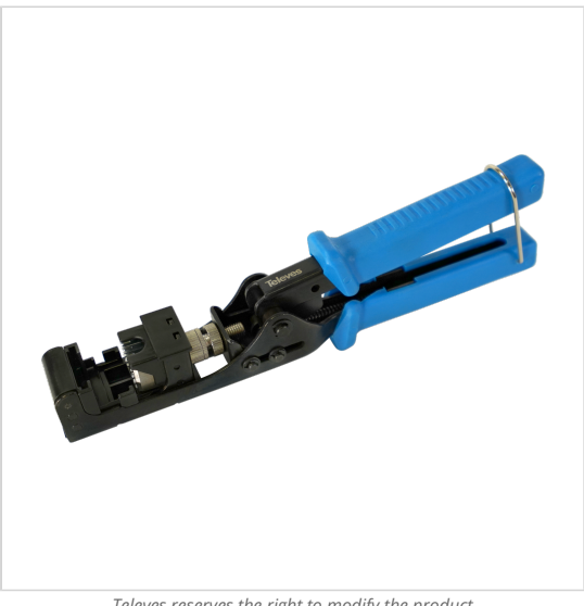
Televes reserves the right to modify the product