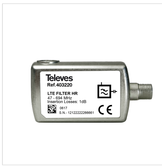
Televes reserves the right to modify the product